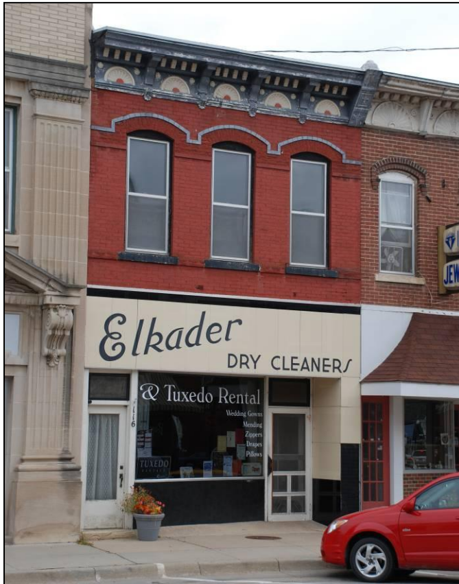
Photographs: 116 North Main, looking east and street view, looking east (September 16, 2010)