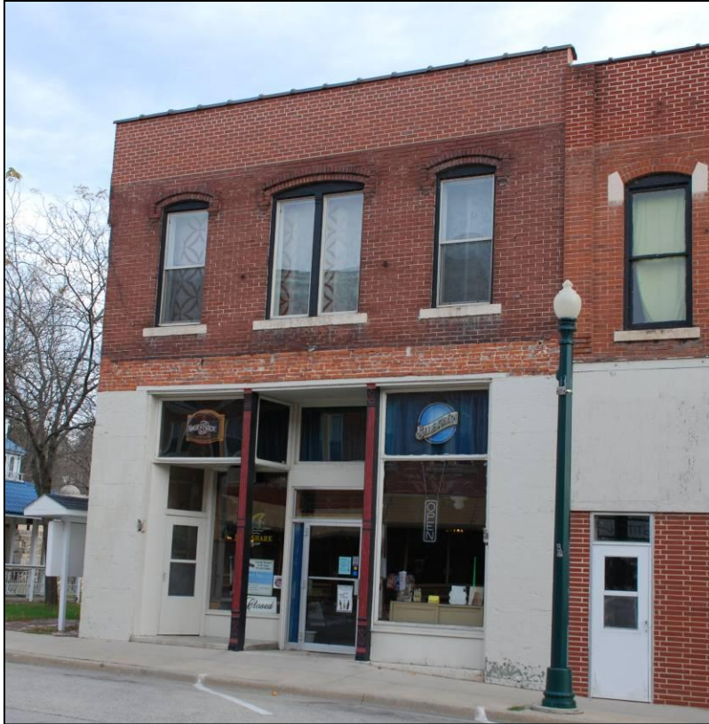
Photographs: 107 South Main Street, looking north east and east at storefront (Elkader Downtown Survey Photograph, 10/29/2010)